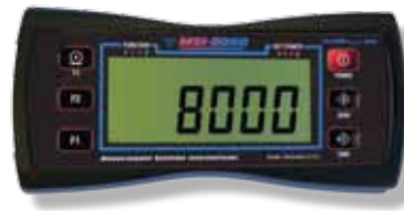
MSI-8000 RF Remote Display