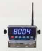
MSI-8004 HD LED Remote Display