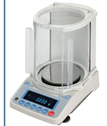
FZ-300i with optional Breeze Break FXi-11